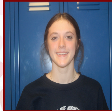
Junior "I would go to a movie then eat dinner on the beach during sunset."